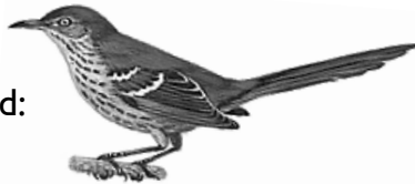
Georgia State Bird: Brown Thrasher

Scene One.....The next morning Scene Two.....Later that day; just after dinner Scene Three.....An hour or two later Scene Four.....The next morning