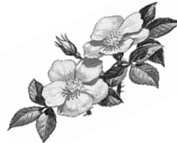
Georgia State Flower: Cherokee Rose